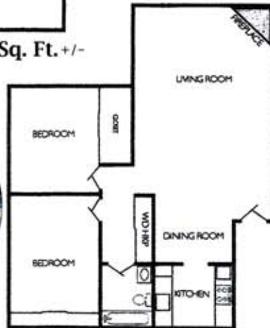
2 Bedroom / 1 Bath / 788 & 907 Sq. Ft. +/-