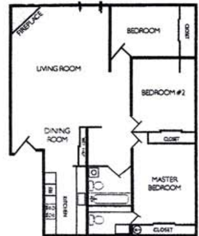
3 Bedroom / 2 Bath / 1,096 Sq. Ft. +/-